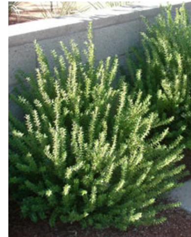
Penstemon Penstemon eatoni / baccharifolius 1 Gal.