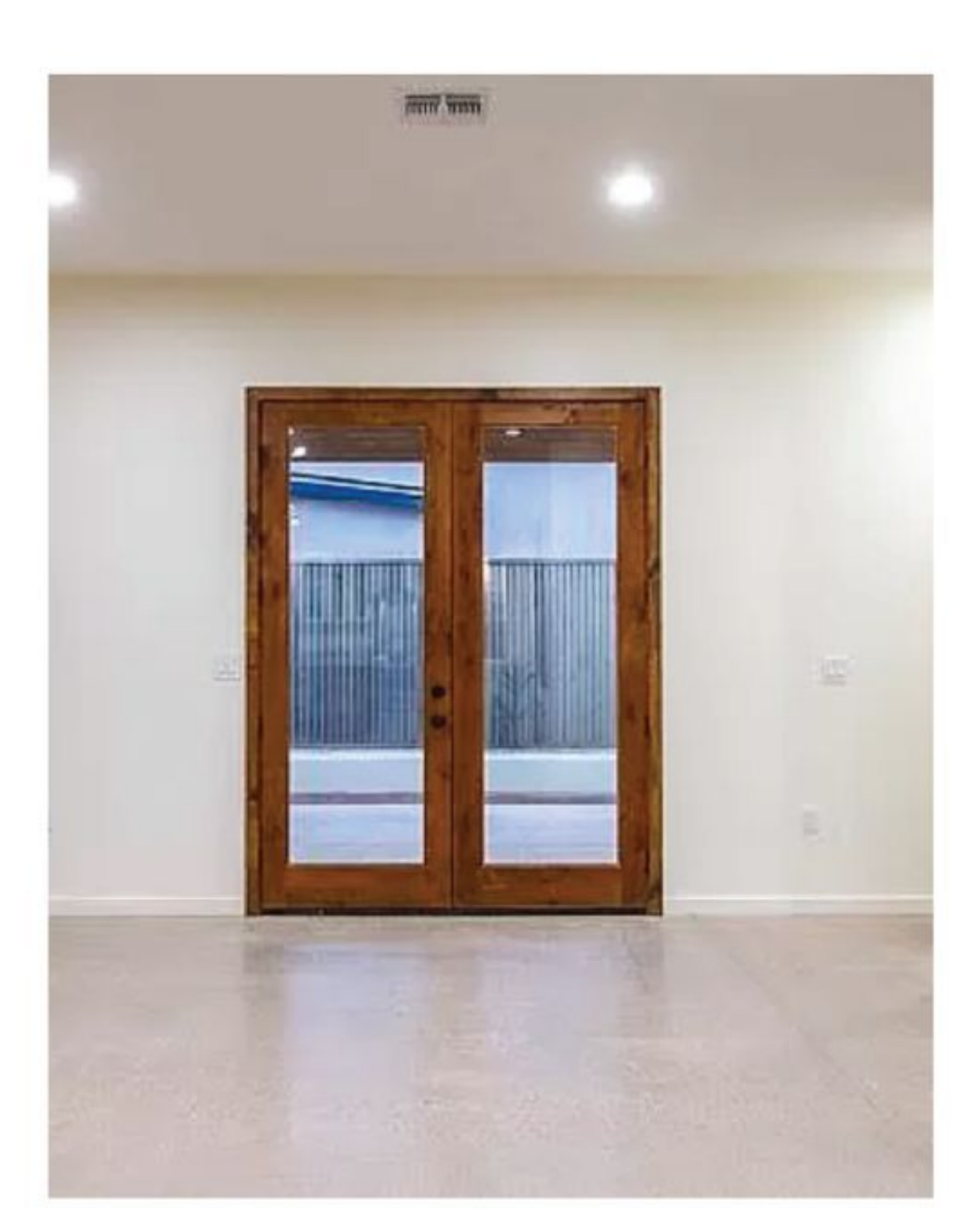
WOOD FRENCH DOORS