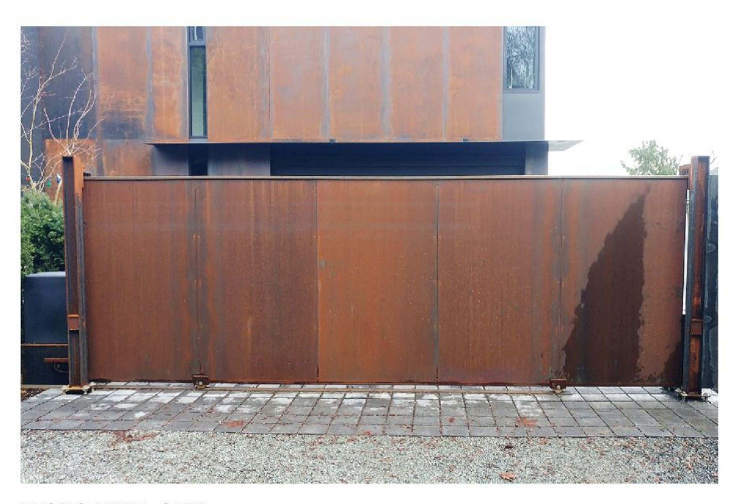
RUSTIC METAL GATE