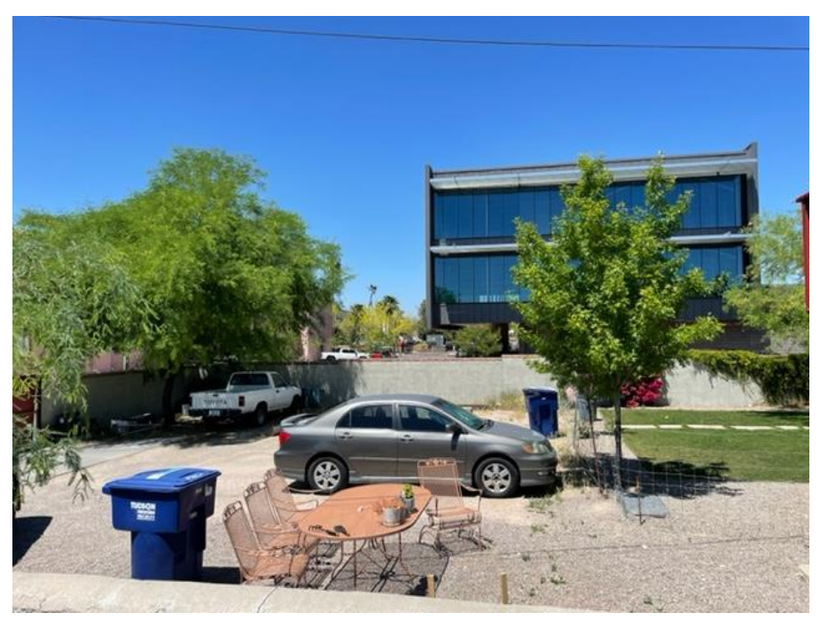
View facing north