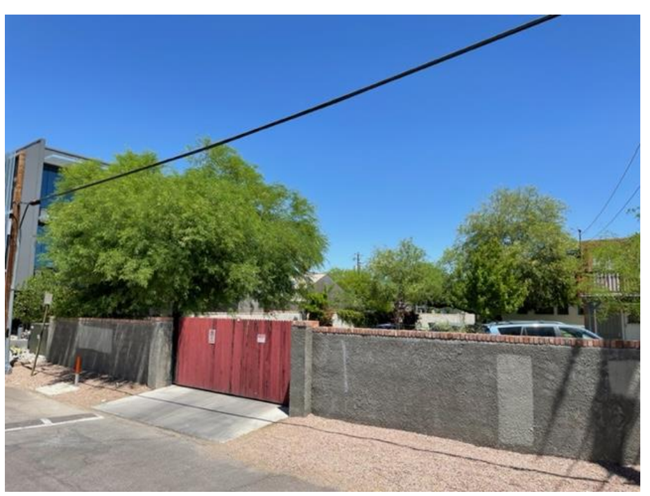
Again, view from church property to the west, looking to the east. Proposed building is behind this wall.