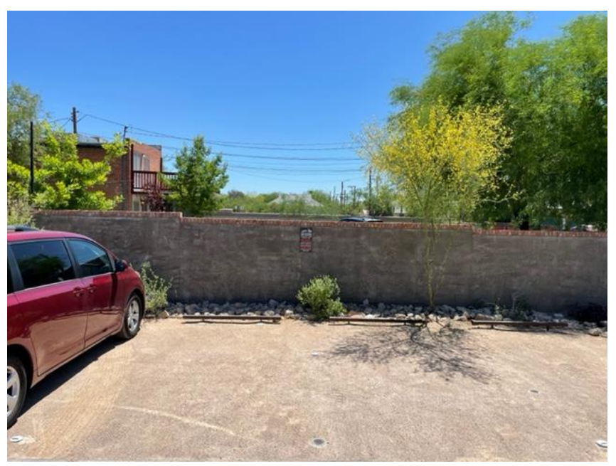
View from north side of adjacent property facing south. Proposed building will be behind this wall