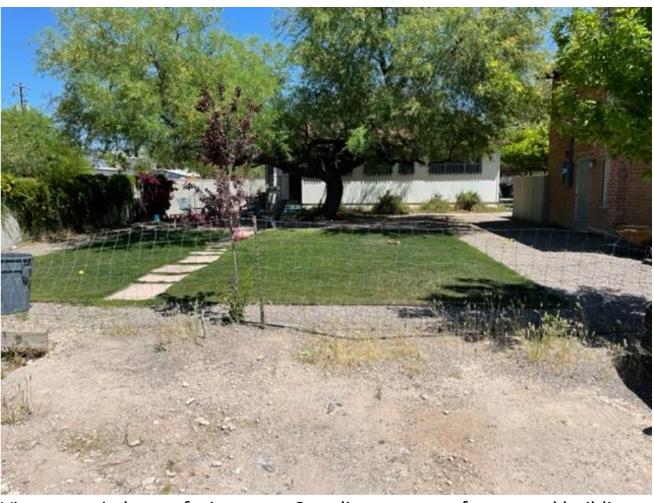
View to main house facing east. Standing on spot of proposed building.