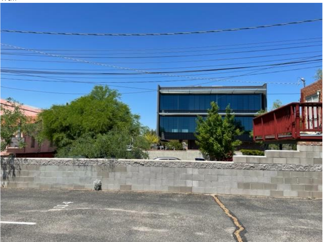
View from adjacent property to the south facing north. Proposed building will be on other side of this wall, but the property drops down extensively behind this wall.