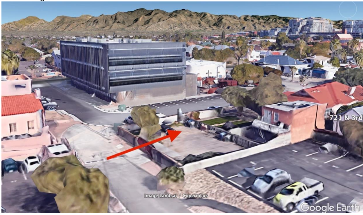
Aerial photo showing location of proposed building.