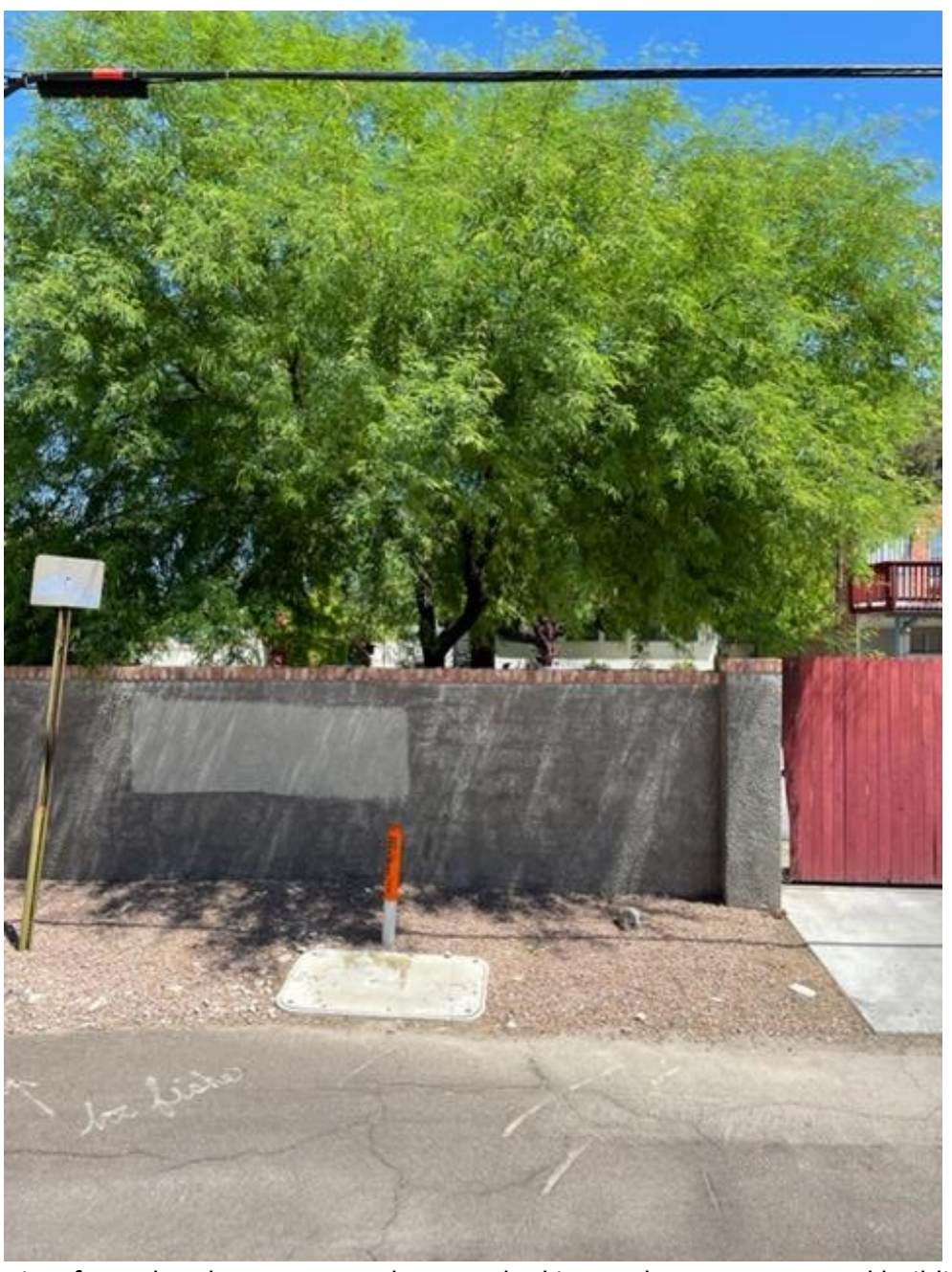
View from church property to the west, looking to the east. Proposed building is behind this wall.