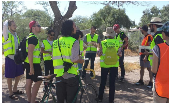
(left) March 28, 2017 – Breaking ground