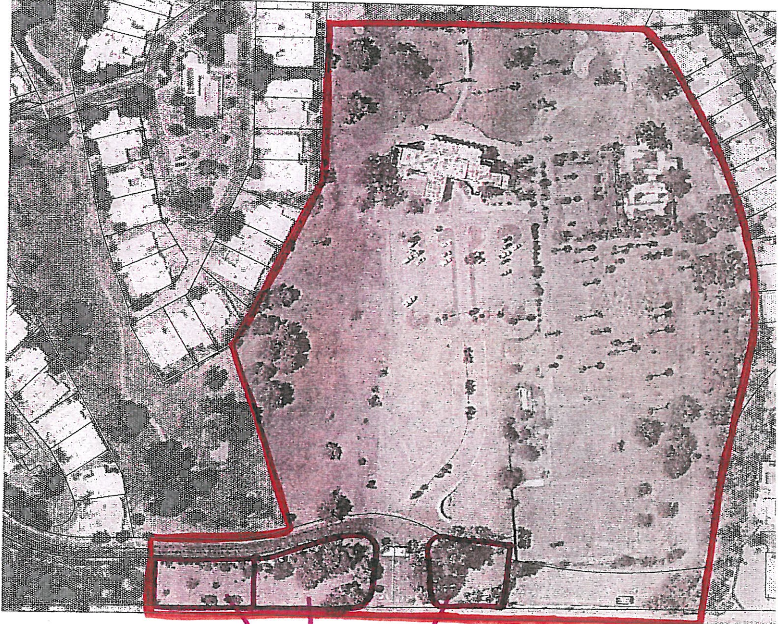
Dorado H.O.A. parcels