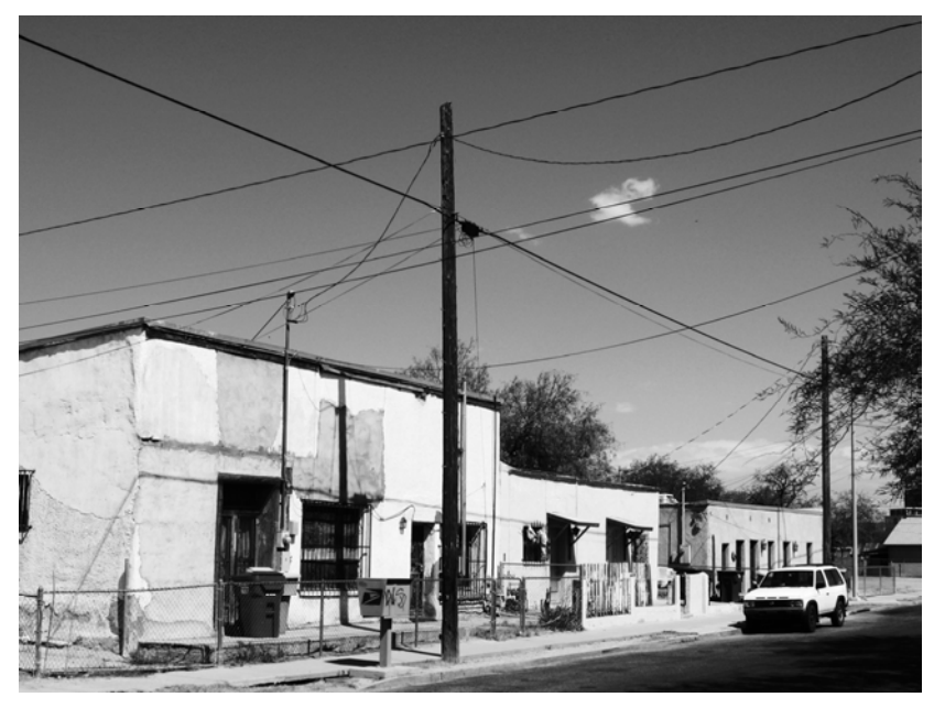
Photograph 10. N. Anita Ave. between W. Lord St. and W. DeLong St.; view southeast.