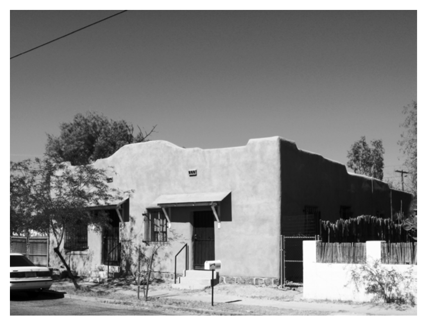
Photograph 22. 1000 N. Anita Ave.; view north-northeast.