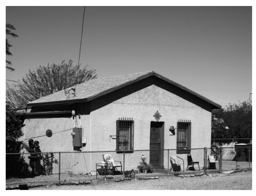
Photograph 6. 608 N. Contzen Ave.; view northeast.