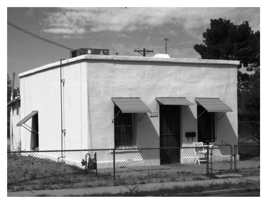
Photograph 17. 999 N. Anita Ave.; view west-northwest.