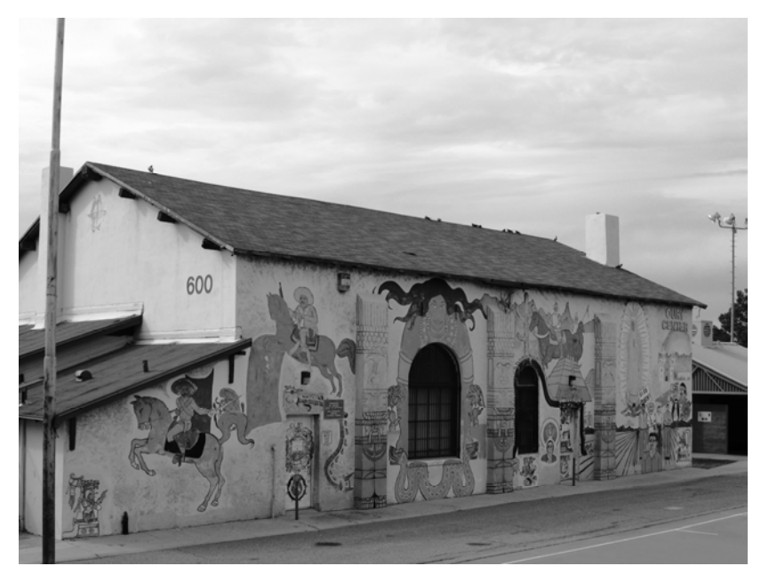
Photograph 8. Oury Center, 600 W. St. Mary's Rd.; view northwest.