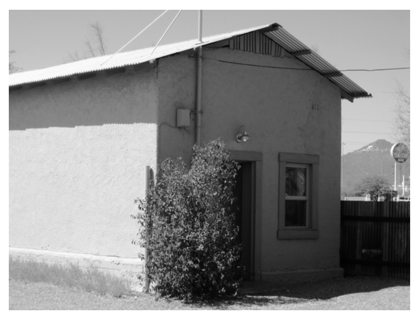
Photograph 20. 519 W. Oury St.; view south-southwest.