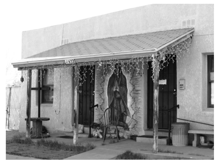
Photograph 15. 632 N. Anita Ave.; view north-northeast.