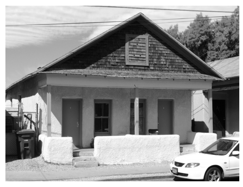
Photograph 4. 657 N. Anita; view west.