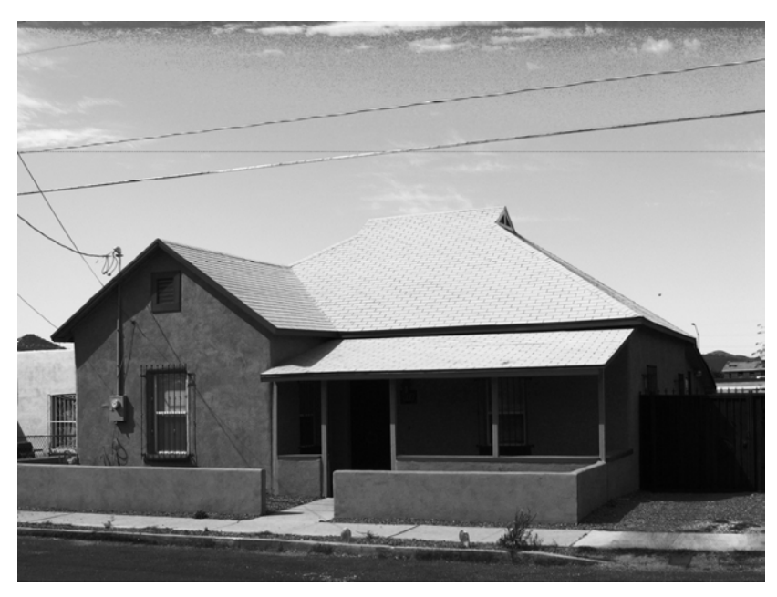
Photograph 3. 911 N. Anita Ave.; view southwest.