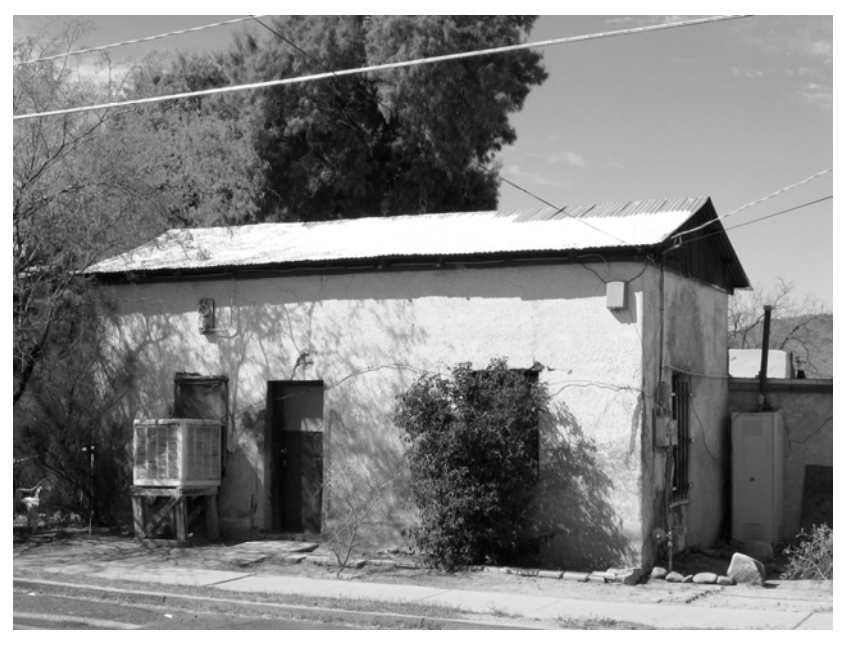
Photograph 19. 673 N. Anita Ave.; view southwest.