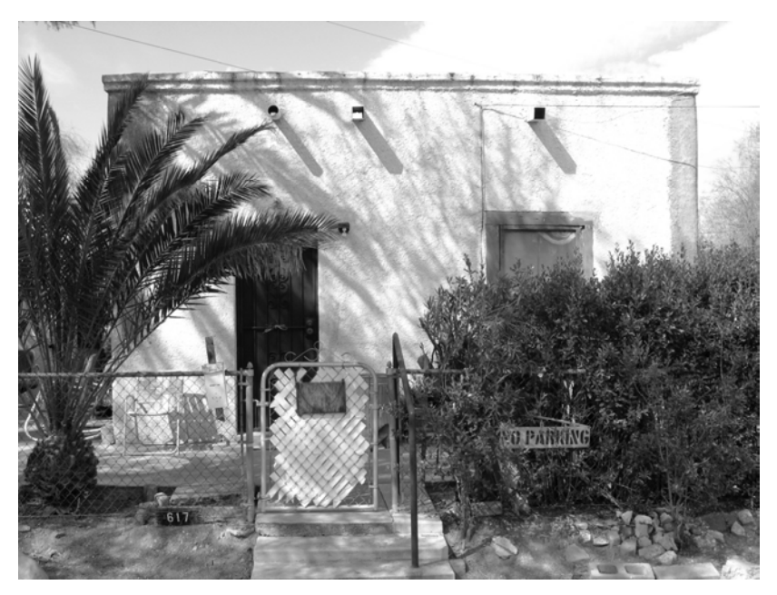
Photograph 1. 617 N. Brady Ave.; view west-southwest.