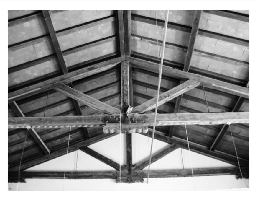
Photograph 25. Oury Center, 600 W. St. Mary's Rd.; interior, view north-northeast.