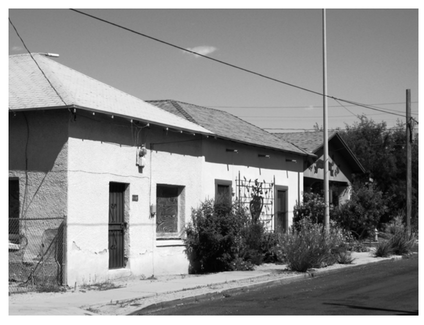
Photograph 9. N. Anita Ave. between W. Davis St. and W. Oury St.; view southeast.