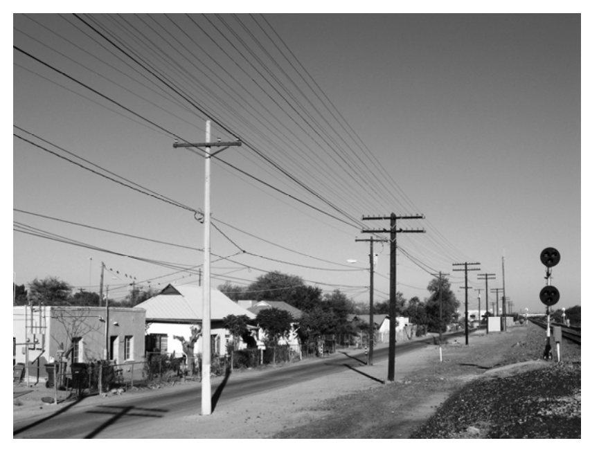
Photograph 12. N. Van Alstine Ave. between W. Oury St. and W. Speedway Blvd.; view northwest.