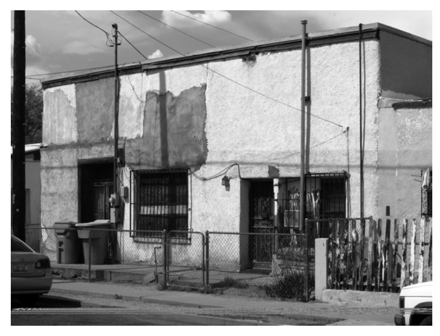
Photograph 16. 926 N. Anita Ave.; view east-northeast.