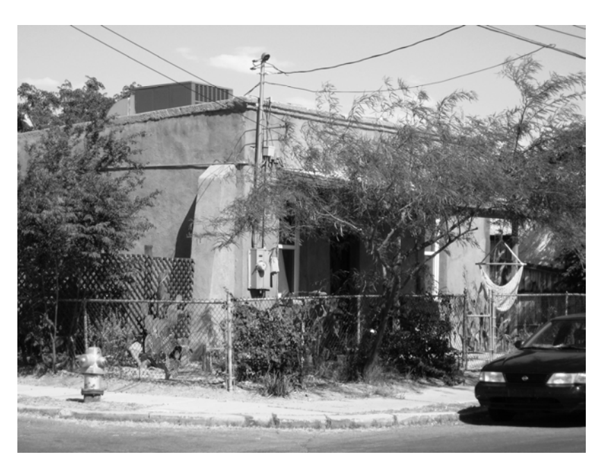
Photograph 24. 798 N. Contzen Ave.; view east-southeast.