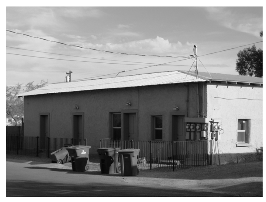
Photograph 2. 515 W. Oury St.; view southeast.