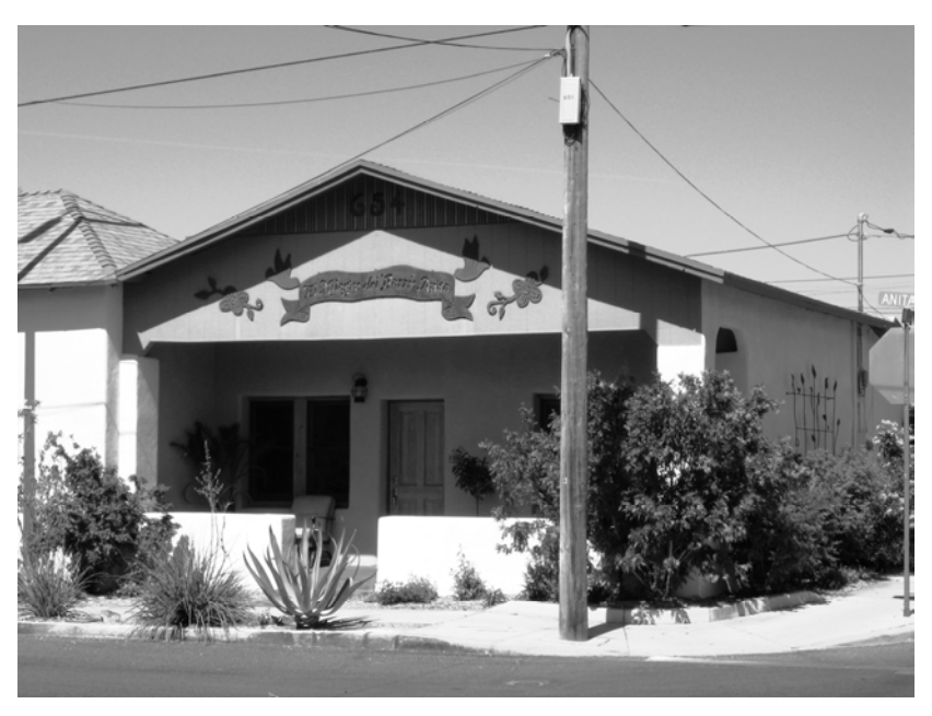
Photograph 5. 654 N. Anita Ave.; view northeast.