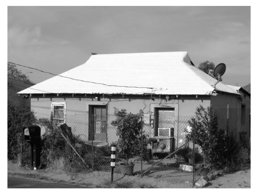
Photograph 18. 700 N. Van Alstine Ave.; view south-southwest.