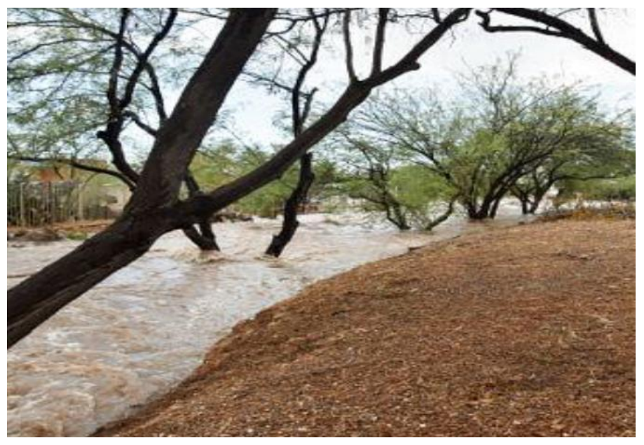
Figure 32: Christmas W.A.S.H. (Watercourse Amenities Safety and Habitat) watercourse. Flood stage for this watercourse extends over the wash embankments.