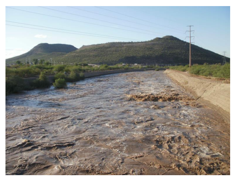
Figure 8: Santa Cruz River bank protection

Levees and soil cement bank protection are commonly used for regional watercourse containment and erosion protection. Soil cement has been successfully used along most of the regional watercourses. In the past, many manufactured housing structures in the Tucson area were located near or within medium to high risk flood zones, posing risks to manufactured home property owners. Apartment complexes and other rental properties pose different challenges for the City as it addresses flood hazard mitigation. Solar infrastructure has been introduced successfully in shallow floodplain areas and within existing basins, providing safe opportunities to double the use in a floodplain area.