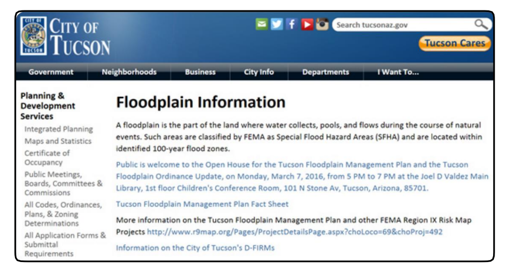
Figure 26: The public outreach announcement on the city's website

While hard copies of the FMP report were available to review at the open house, attendees were encouraged to access the project Web site www.R9map.org and download a digital copy of the report. A Fact Sheet with an executive summary of the FMP and directions on how to download the report were available at the open house in case attendees preferred to review a digital copy of the report. The public comments and responses were prepared for the public hearing.