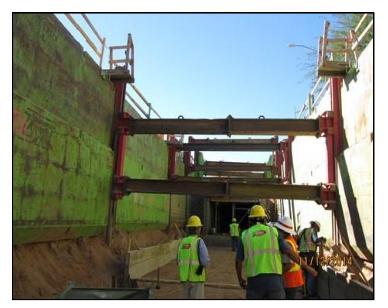
Figure 22: Construction of High School Wash storm drain

Figure 21: Phase 2B: basin 2 Sept. 8, 2014