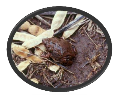
Figure 2: Sinaloan Narrow-Mouthed Toad - native to the West Branch Santa Cruz River

* Pima County included under statewide Hazard Mitigation Grant Program assistance.