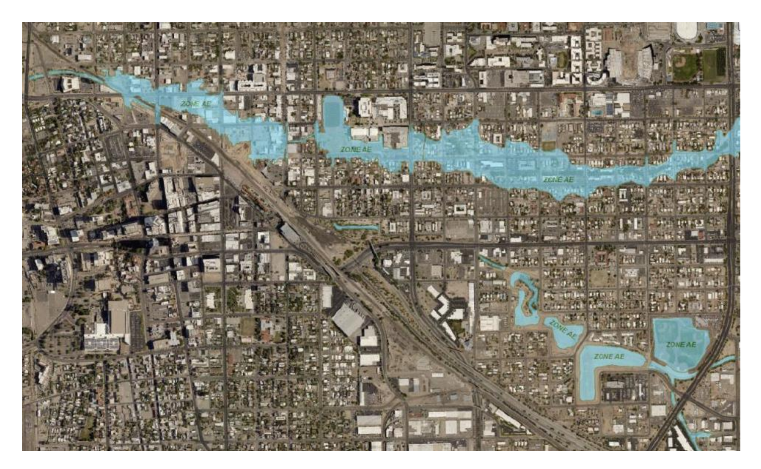
Figure 23: Downstream of the Arroyo Chico drainage improvements is the "Downtown Links" road improvement project which was not formally a part of the Tucson Arroyo Chico Conditional Letter of Map Revision (CLOMR)

The City Transportation Department also installed storm drain system in the area of Main Avenue at the downstream portion of the Tucson Arroyo. The City has also replaced the Arroyo Chico storm drain along 8th Street for future transportation improvements, and is planning further upgrades to the storm drain system on the upstream portion of Tucson Arroyo as part of the future "Downtown Links" road improvements.