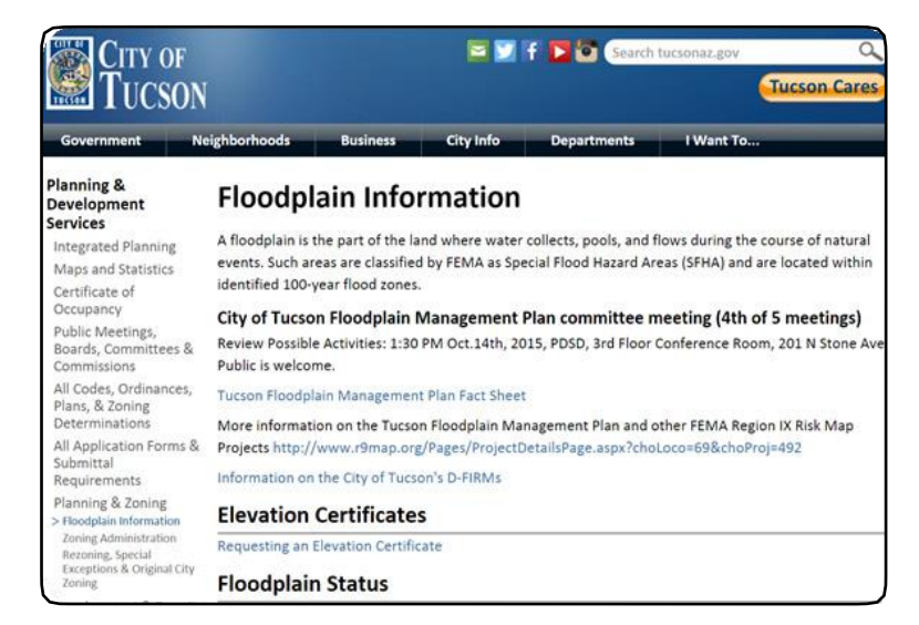
Figure 25: The City of Tucson's FMP information website

Since the FMP process is a foreign concept to many, the project team drafted a Fact Sheet as a quick way to convey important components of the FMP process. This Fact Sheet was posted to the project Web page and was displayed in the PDSD on the first floor of the County- City Public Works Building at 201 North Stone Avenue.