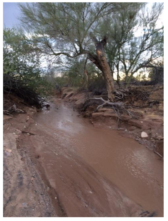
Figure 33: As floodwater erode side banks, natural lateral migration of washes occur