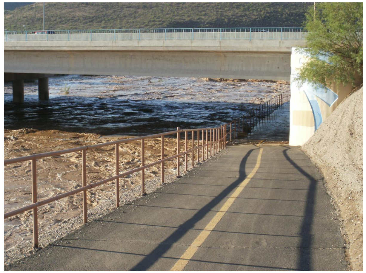
Figure 27: Santa Cruz River Bike Lane Underpass – flooded