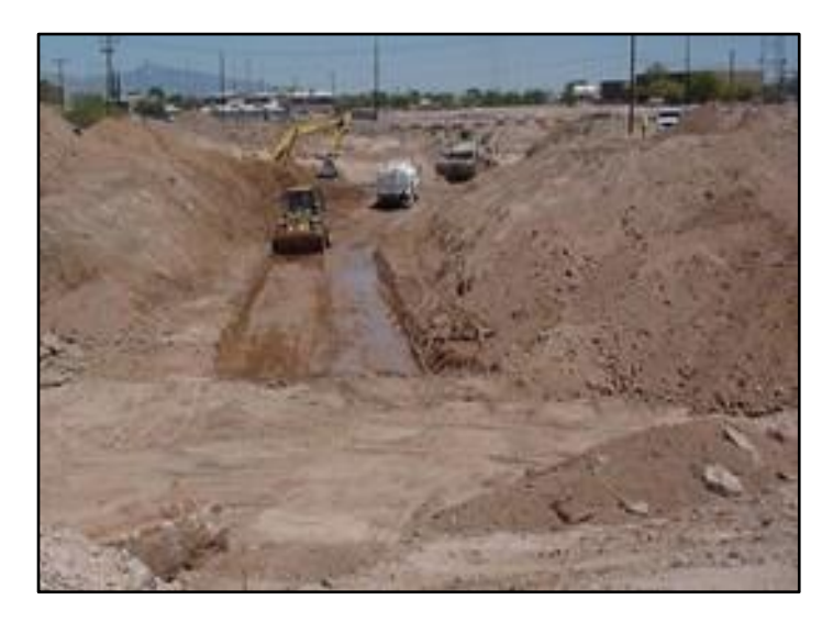
Figure 20: Phase 2B - Park Avenue Basin 2 Under Construction