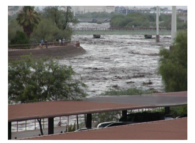
Rainfall runoff generally flows from the southeast to the northwest across the Tucson area. Flows are not allowed to be obstructed per code. Runoff generally flows within streets, rights-of-way, and in other drainage systems, from property to property, matching pre-developed flow conditions. Rainfall runoff conveyance in the City of Tucson includes storm drains, side yard swales, wall openings, improved structural channels, natural channels, semi-natural channels, sheet flow, and other systems to continue its path to feed vegetation and eventually, with remaining flow, recharge in the regional watercourses.