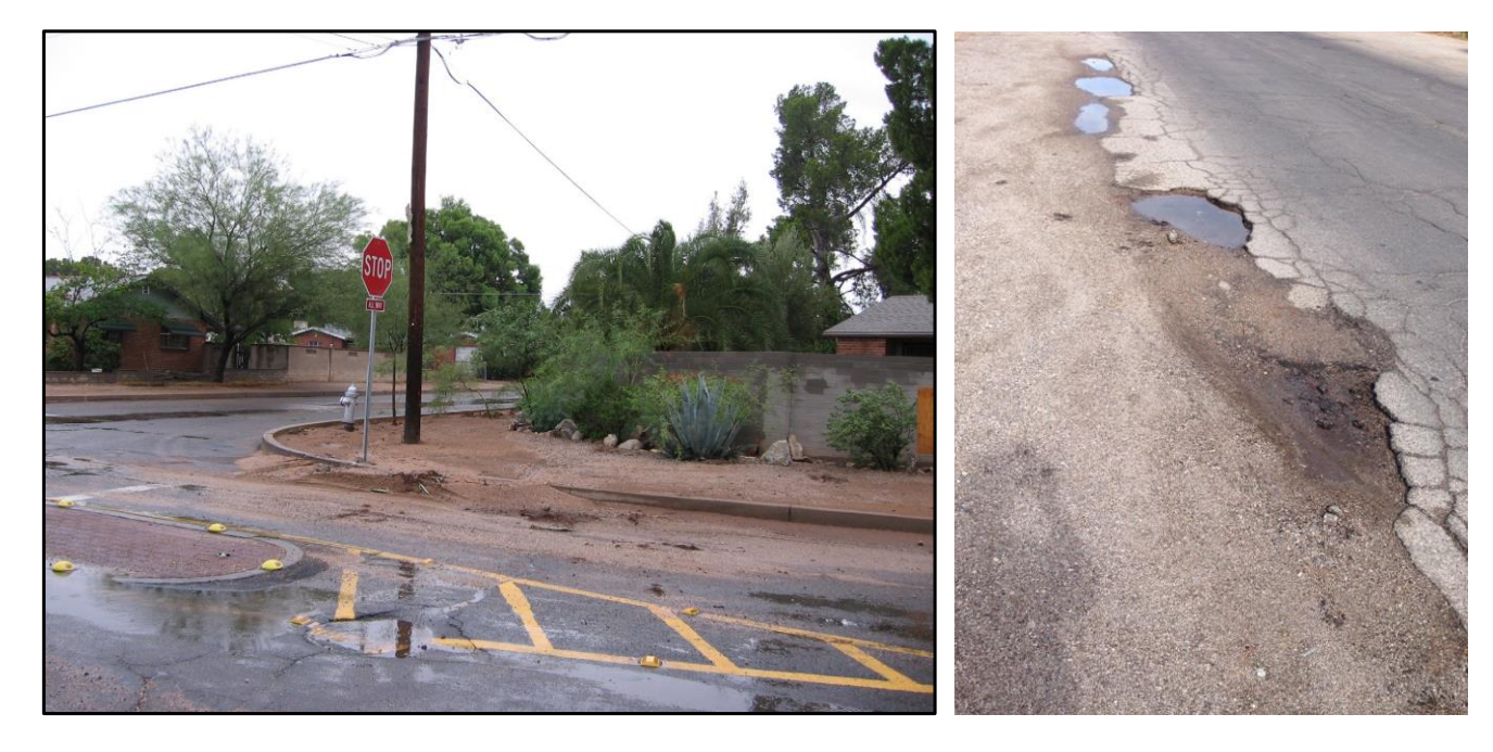
Figure 15. Erosion in right-of-way.