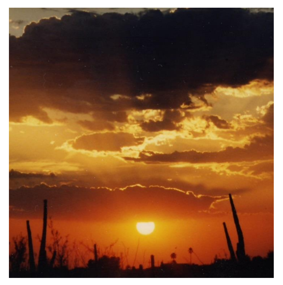
Figure 14: Sunset after a Tucson storm

The FMP is an outgrowth of the Upper Santa Cruz Discovery process FEMA initiated in the fall of 2011. Discussions between FEMA and city officials resulted in this plan being created to facilitate floodplain management activities in Tucson. FEMA's Risk Mapping, Assessment, and Planning, or Risk MAP program, helps communities identify, assess, and reduce natural hazard risks. Through Risk MAP, FEMA provides information to enhance local mitigation plans, improve community outreach, and increase local resilience to hazards. The Upper Santa Cruz Discovery Report can be found in the Appendix of this report. More information regarding the Discovery process is available on FEMA's website, www.fema.gov. After the Discovery process came to a close, FEMA recognized that there is potential to expand on best management practices and encourage a more resilient community within Tucson. Flood risk products are created as a means to provide concrete evidence and reference materials to those who manage floodplain material data. With the development of an FMP, participants can create an action plan for floodplain management, and can ultimately reduce region-wide flood insurance rates.