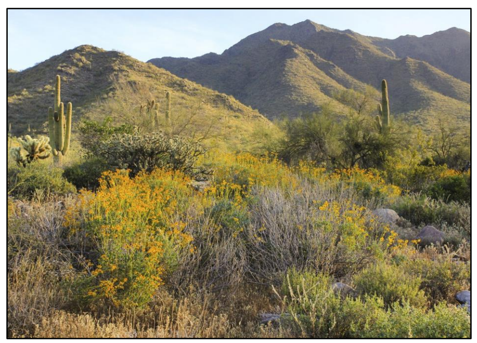
Figure 37: Tucson's landscape in bloom

The committee considered all possible activities as potential mitigation measures, noting which ones were valid and which ones should not be considered. The problem statements were arranged in matrices according to hazard, and the top five problems were listed so that they could be assessed against their potential mitigation activities in a systematic way. Blanks in the matrices mean that the activities were considered, but the FMP committee did not deem them applicable. The full spreadsheets are located in the Appendix of this report. As the committee filled out the matrices, they were asked to highlight the activities the committee recommended most for those problem statements. Although not all activities were selected for inclusion in the action plan, the city will catalogue all responses for consideration in future updates to the FMP.