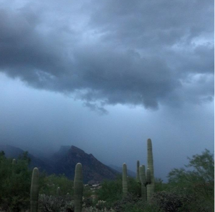
Figure 17. Desert monsoon sky

The list of committee members that attended each committee meeting is included in the meeting minutes in the Appendix of this report.