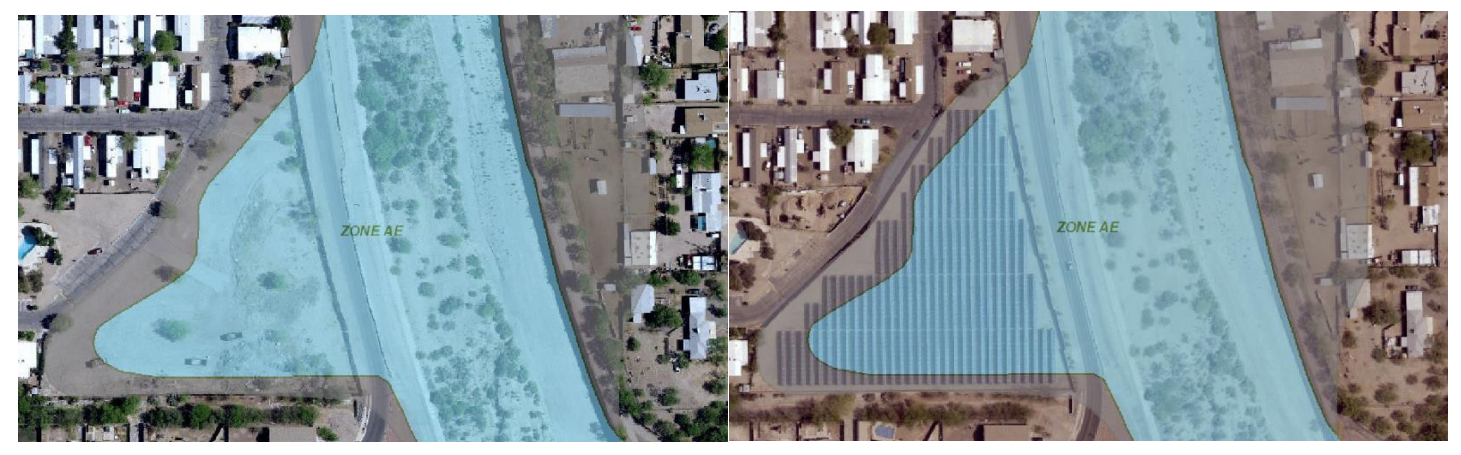
Figures 30 & 31: Before & after: dual purpose: ineffective flow area floodplain & solar project – reduces community's electrical costs.