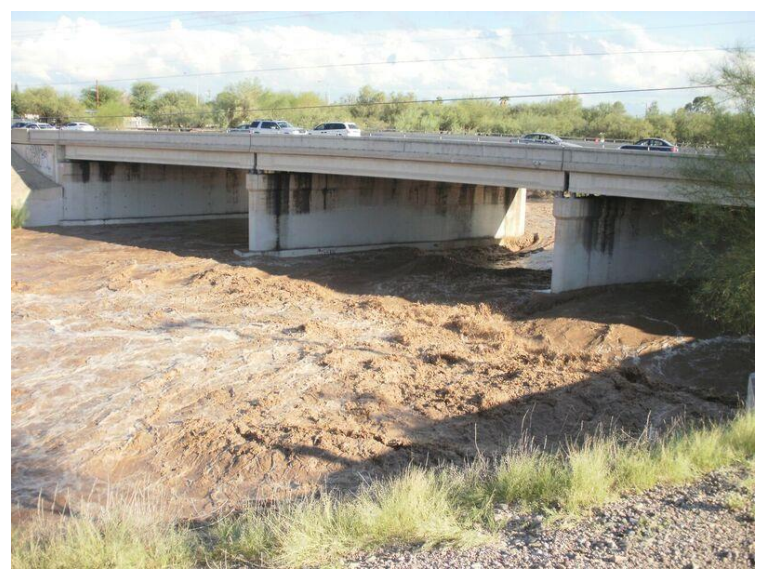
Figure 35: Sediment transport is common in the desert

<u>1.</u> <u>Identifying high-risk areas</u>. While many flooding sources in Tucson have been mapped and officially recognized by FEMA, the city acknowledges that some flooding sources are in need of restudy due to development and other pressures. In addition, determining the locations of the high-risk areas will help inform capital improvement plans, outreach strategies, and emergency management plans in addition to having many other purposes.