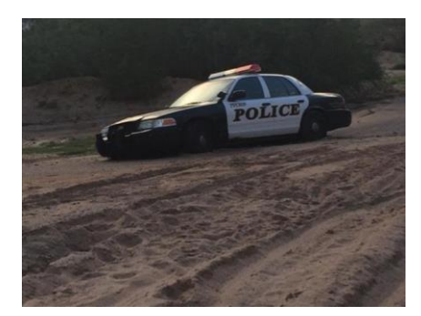
Figure 7: Emergency responders often conduct swiftwater rescues. Vehicles or people are sometimes swept away in the fast moving water, and many resources are required

Tucson has a semiarid climate where post-storm evaporation rates are high, and soils are more permeable in the regional watercourses where the fastest rate of infiltration to the underground aquifers occurs. Regarding soil characteristics, Tucson is different than Phoenix and other jurisdictions to the north. Tucson has variable gradients throughout the city and experiences infiltration challenges including caliche and C & D hydrologic soils types. These soils are harder for rainwater to infiltrate and thus ponding issues typically arise.