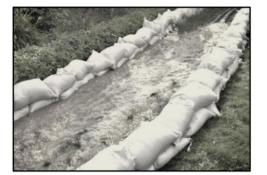
Figure 36: Sandbagging is an easy and cost-effective technique to battle flooding