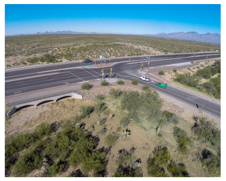
Figure 38: Houghton Road Improvements on Atterbury Wash Watershed

The following chart (Table 5) looks at these 5 Goals and the Activities identified by the FMP Committee and provides information about the responsible entity for the Activity and schedule.