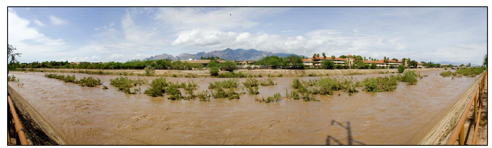
Figure 3: Panorama of the Rillito downstream/west of Campbell Avenue