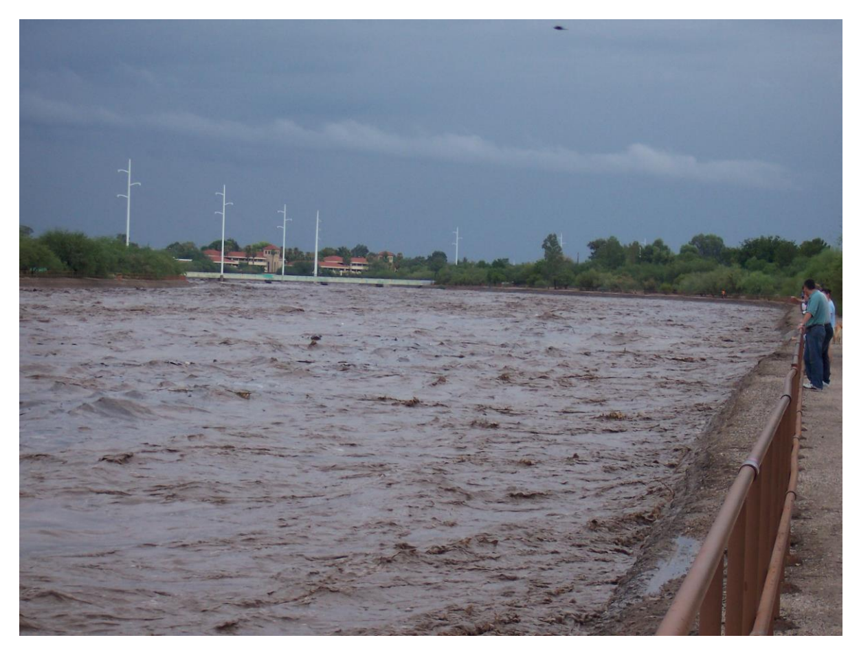
Figure 13: Regional watercourse near flood stage

A new version of TSMS called Tucson Watershed Modeling System (TWMS) is currently under development. TWMS is a more modern map-based system using GIS, ArcView and HEC-HSMS. The hydrologic modeling software developed for the TSMS had consisted of DOS-based programs that had become outdated over time. In order to utilize more current software, as well as utilize more advanced GIS-based data management tools, the City of Tucson initiated development of the TWMS (User's Manual, June 2008) as a replacement for TSMS software package. TWMS incorporates automated watershed management tools in a GIS environment. The TWMS provides the City with the ability to calculate stormwater flow values for use in planning, floodplain management, and hydraulic design.