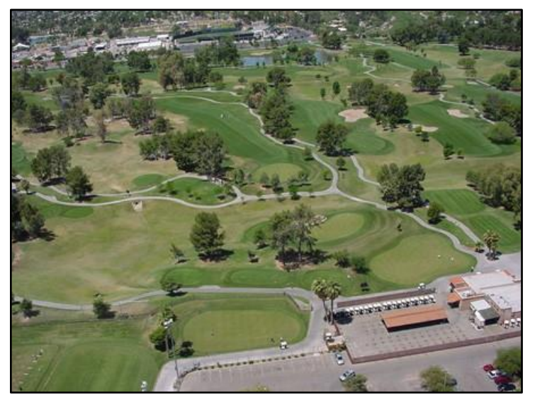
Figure 18: Phase I The fairways at Randolph South (like Kennedy Park) were reconstructed to be storm detention basins and are categorized as reservoirs.

The Tucson Arroyo and its tributaries -- High School Wash, Railroad Wash, Citation Wash, Paseo Grande Wash and Naylor Wash -- drain an area of 11.4 square miles located in central and downtown Tucson. The watershed is almost fully developed and contains a mix of residential, commercial and industrial areas. The downtown drainage infrastructure was originally constructed in the 1920s, 30's and 40's, which includes 1.7 miles of underground culverts. Because of the increased runoff due to urbanization the capacities of the existing drainage infrastructure was inadequate to convey the peak flows caused by intense thunderstorm events, resulting in frequent and severe flooding of residential, commercial and industrial areas along the entire length of the arroyo. Potential flood damages to both private properties and public infrastructure were estimated by the USACE at $2.7 million (1998 prices) annually.