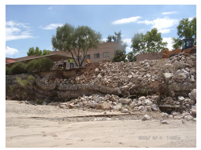
Figure 34: Flooding can easily damage city infrastructure