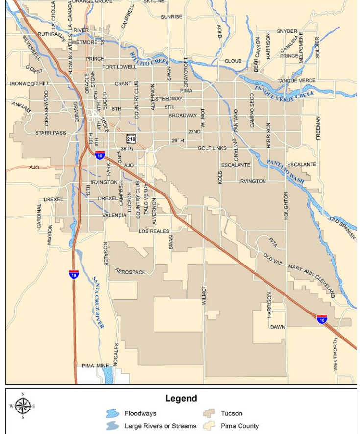
Figure 4: Map of Tucson Arizona with Regional Watercourses labeled

Tucson experiences a desert climate with a rainy summer thunderstorm season called "monsoon", and gets an average of 12 inches of rain annually. While a majority of Pima County is considered rural or moderately developed, Tucson is decidedly an urban area and the challenges it encounters differ and are more pronounced than those endured by the other Pima County communities. Precipitation in Tucson is higher than most desert climates, which is cause for more flash flooding than in other parts of the state. Because many areas of the city do not have storm drain systems, Tucson often experiences flooding in the streets. The most common risks identified within the City of Tucson are flooding, erosion, sediment transport, and flash flood events.