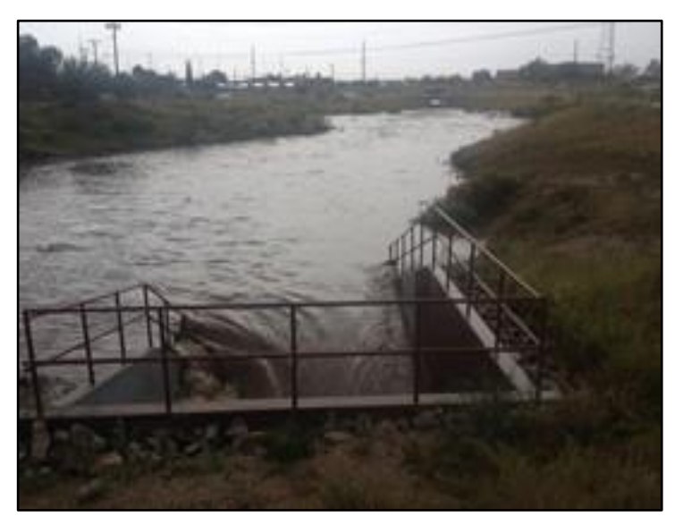
Figure 21: Phase 2B: basin 2 Sept. 8, 2014