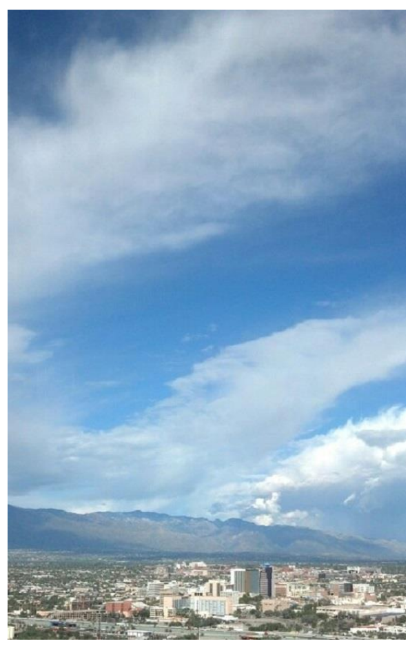
Figure 12: Downtown Tucson

Plan Tucson is the City of Tucson's General & Sustainability Plan, which was ratified by voters in 2013 and acts as a master planning document providing broad planning focus for Tucson, including reducing hazards. Plan Tucson goals and policies are intended to reduce, through preventive measures, the potential harm to life and property in natural hazard areas as well as hazards resulting from human activities and development. All Ward offices encourage the use of Plan Tucson, and other Tucson planning documents, when making decisions regarding the management of floodplain and other hazards.