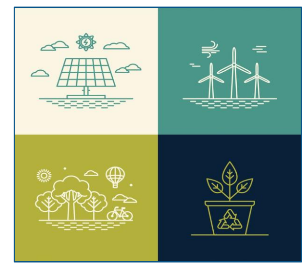
Figure 29: Sustainable practices create vibrant communities