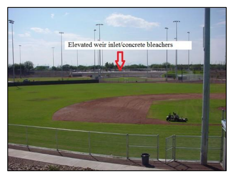
Figure 19: Phase 2A - Cherry Field basins are now a combination sports facility and flood control detention reservoirs maintained by Pima County.